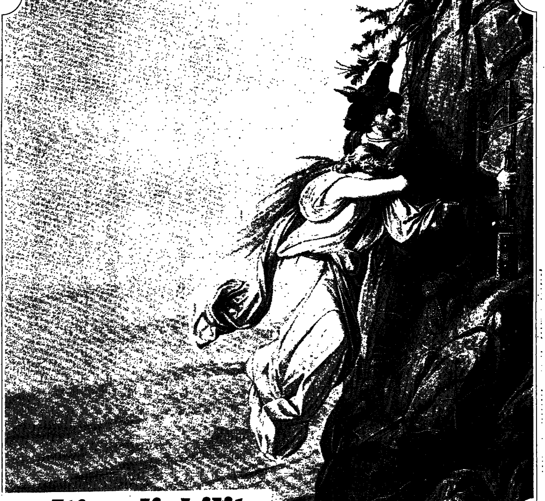
Bode: Schack-Galerie, Munich